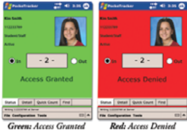
Green: Access Granted