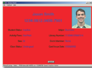
Red: Access Denied

PockeTracker and RapIDTrack Red/Green are powerful and efficient identity management tools that can meet any tracking and verification need. The PockeTracker "Go Anywhere" entry access management system was designed to be easy to use and highly user configurable, while it easily fits in the palm of your hand. RapIDTrack is a desktop version of our tracking software that can be installed on a PC.